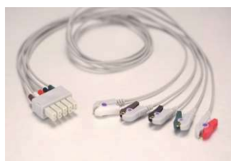
Reusable ECG Lead Wire 5 Leads