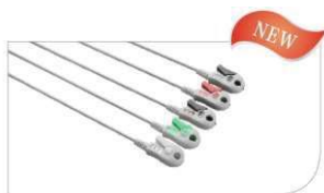
New Design Clip