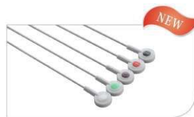
Snap for Neonatal/Infant