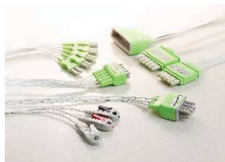
Disposable ECG Lead Wire