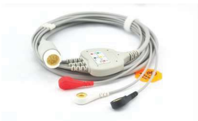
One-Piece ECG cable 3 Leads

The reusable and disposable ECG cables designed and manufactured by APK are well recognized by European and American clients. Ever since we had the professional R&D team which has rich experience of working with GE/Philips on board, the quality and stability of our ECG cables can be the top quality products in this industry. Meanwhile, our cables has a very attractive pricing strategy to support our long term partners.