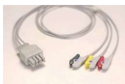
Nihon Kohden Type