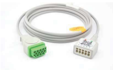
ECG Trunk Cable